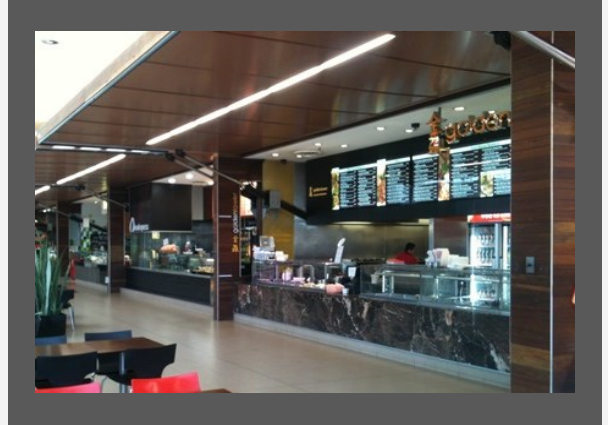
Open shop front doors