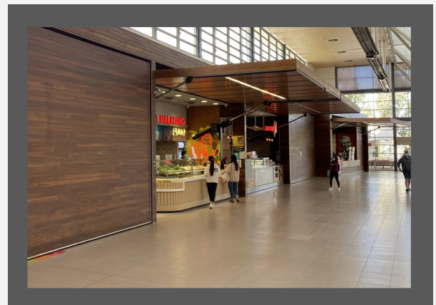
Closed and open shopfront doors