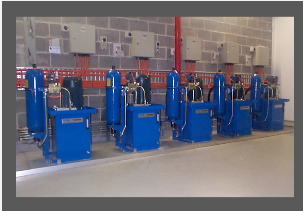
Hydraulic power units in the plantroom

The system also incorporates a number of safety elements to ensure the doors stay open even in the event of a power failure.